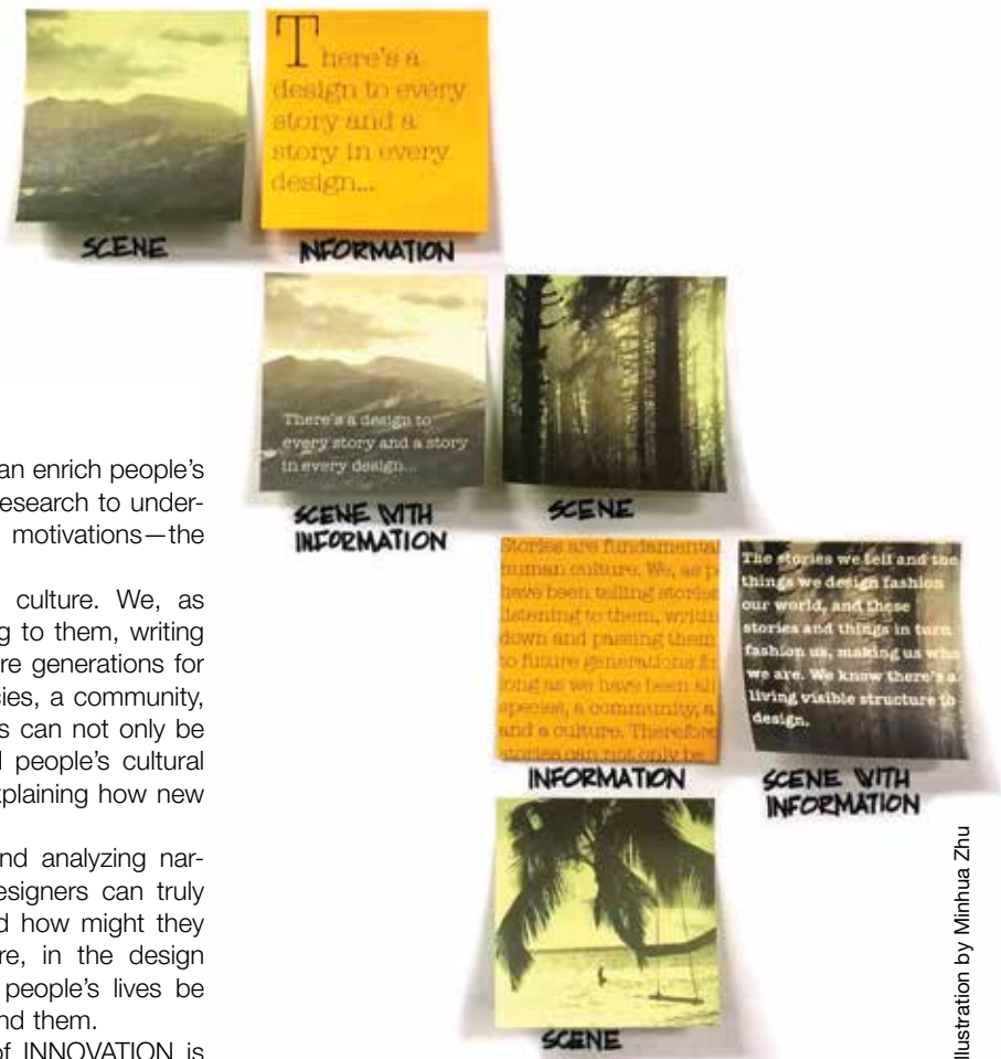
Illustration by Minhua Zhu

to create new designs for products that can enrich people's lives, designers engage in ethnographic research to understand the habits, rituals, likes, dislikes, motivations—the culture—of individuals and social groups.