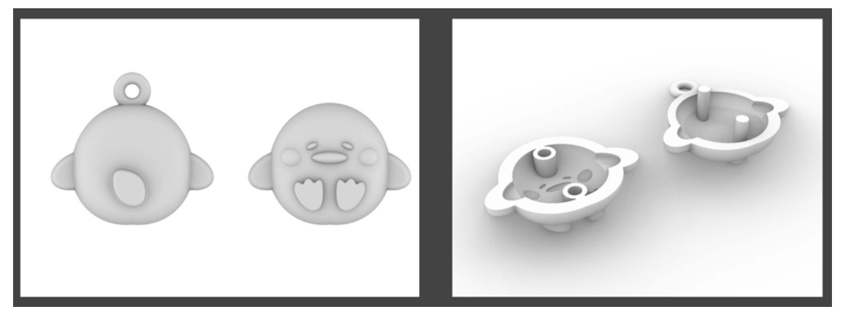
Figure 3. Hollow duck charm part design. Design and image by Karina Amsden and Ayu Nguyen.

Applied areas of learning that are presented with this project include: understanding of small parts, wall thicknesses, in-gate and overflow placement, knit line formation, application of draft angle and design for assembly. Starting with small part size, students learned to think about detailing on a product at this scale. Initial part designs commonly included elements that were visible in CAD models and renderings, but were too fine to be noticeable in the production parts. In project reviews, students remarked that concepts with interesting bounding shapes and comparatively large feature details resulted in stronger products, such as the example shown in Figure3 and Figure4.