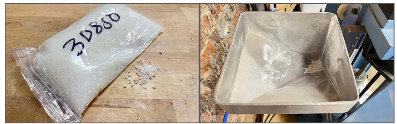
Figure 2. Nature Works 3D850 polylactic acid pellet with yellow colorant and view into the Mini-Jector hopper.

negatively with the mold materials or the production part materials and was clearly helpful in releasing parts from their molds, as intended.