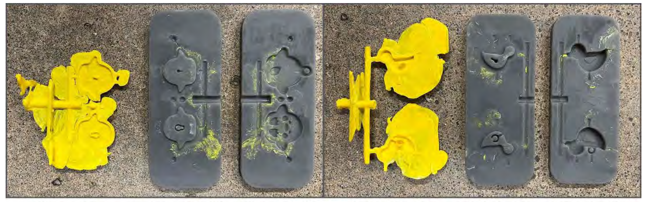
B-Side of charms B-Side of mold A-Side of mold B-Side of charms B-Side of mold A-Side of mold Figure 5. Injection-molded hollow duck charm parts and mold sides. Designs by Karina Amsden, Ayu Nguyen and Gemti Lowenstein.

As seen in Figure5, excessive flash was consistent in the injection molded parts. The target cavity size was set at the project outset so that the same shot volume, temperature and pressure could be set on the injection molding machine for all of the student projects. The shot size was set larger than the target volume of the mold cavities to ensure that short shots would be an issue of restricted part and mold design, rather than an issue with shot volume. The quantity of flash was considered unfortunate, but acceptable by the instructor and technicians.