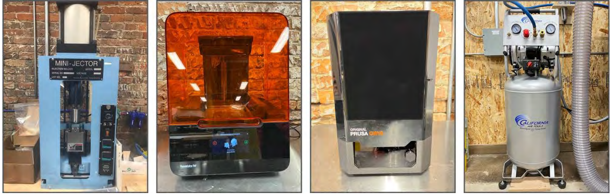
Figure 1. From left to right, Mini-Jector Model #45 injection molding machine, Form 3 SLA printer, Prusa Curing and Washing Machine and air compressor.

The two main pieces of equipment are a Mini-Jector Model #45 and a FormLabs Form 3 SLA printer.