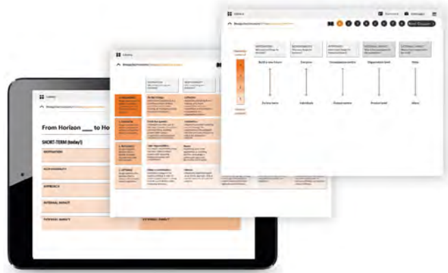
Screenshots from the Livebook app