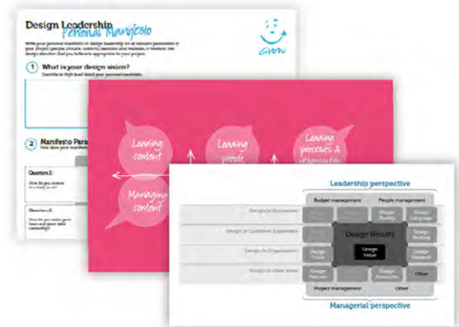
Design Leadership comes with the Design Leadership Personal Manifesto tool.