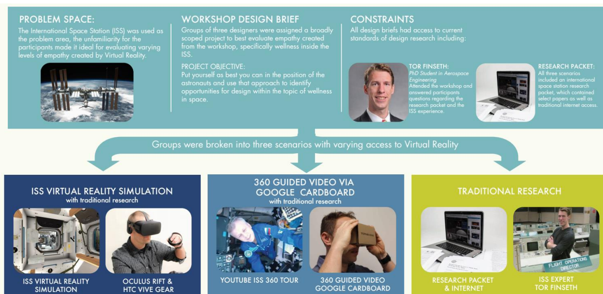
Figure 1: Research Group visual breakdown

In an effort to create control groups, students were divided into three research groups. Each group was provided a varying level of presence or immersion into the problem space. All groups had access to the traditional research packet (revolving around injury prevention and hygiene issues aboard the ISS), internet, and an ISS expert. The first group was allowed only the traditional methods of research. The second group was provided the same research packet, interview, and a 360-degree video tour of the international space station. These students were then able to view the tour through a low cost VR viewing headset (Google cardboard™). The third and final group was provided the same research packet and interview as the other groups; along with an immersive ISS simulation experience that was accessed through the Oculus Rift and HTC Vive head mounted VR displays. All of the groups had the same amount