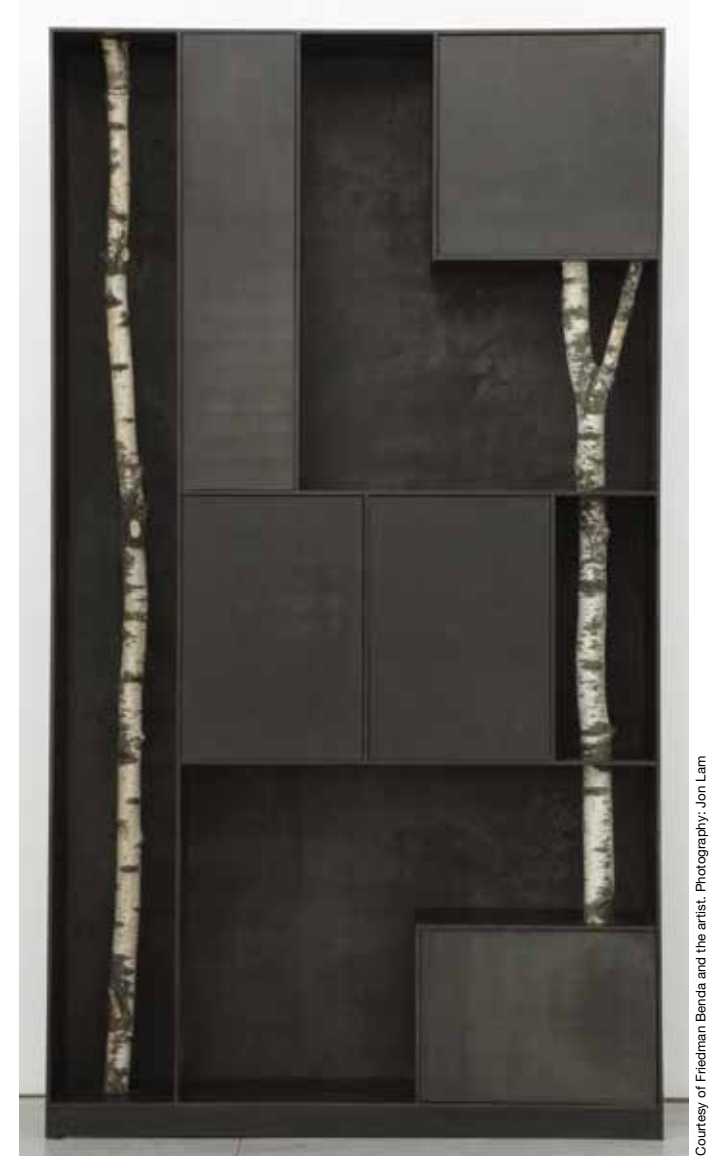
Tree 9 by Andrea Branzi

AB: Global Tools never went beyond the conceptual stage.